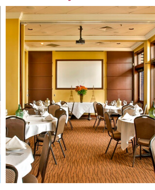
Accommodates up to 60 seated or 75 standing guests.