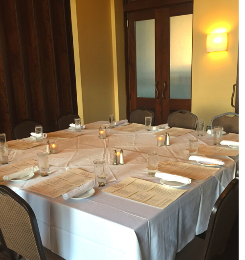
Accommodates up to 16 seated or standing guests.