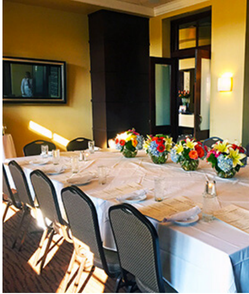
Accommodates up to 32 seated or standing guests.